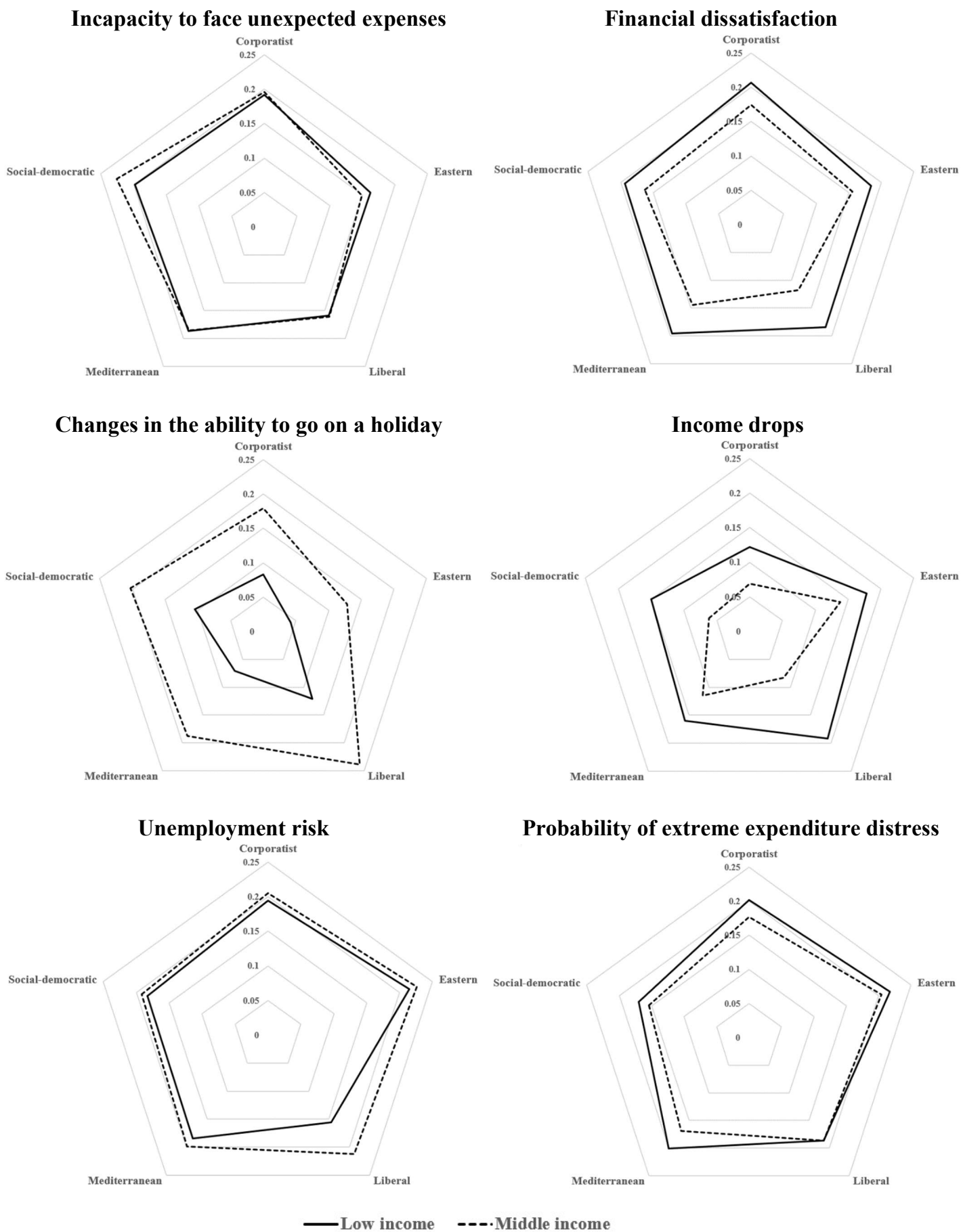
FIGURE 3. Contribution of dimensions to the economic insecurity adjusted rate ( M_{EI} ) by income groups.